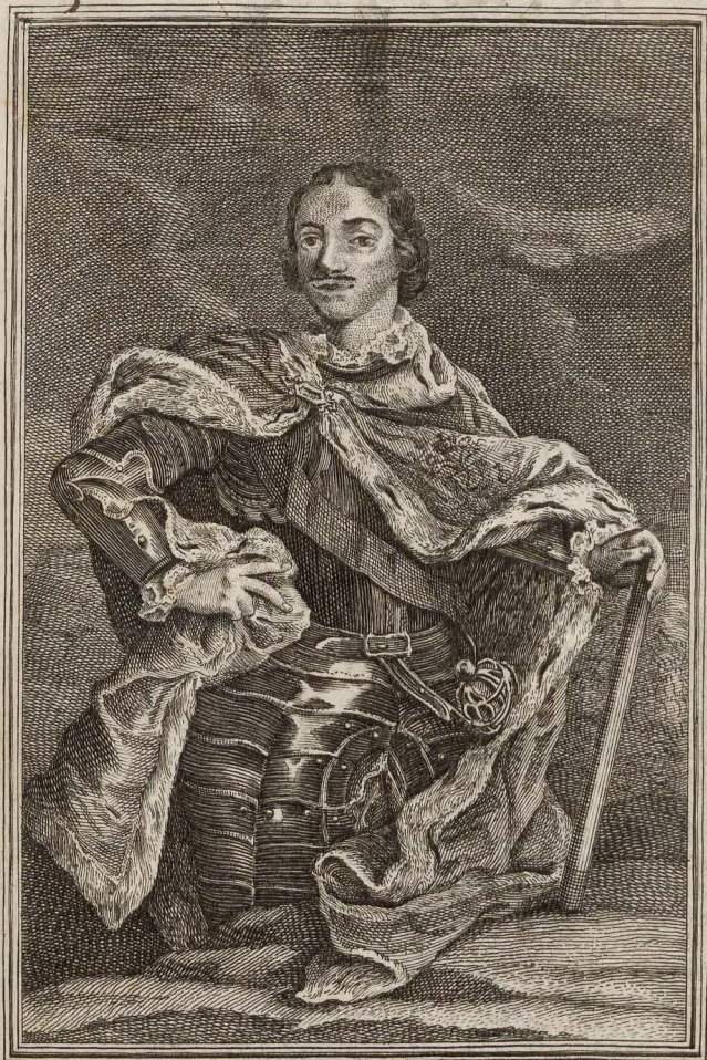
PETER the GREAT, CZAR of MUSCOVY.